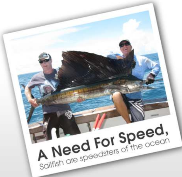
A Need For Speed, Sailfish are speedsters of the ocean

There are many different ways to target Sailfish from the shore and by boat. Here are 3 ways to target them by boat: 1) Trolling lures (least preferred method), 2) Slow-trolling whole fish baits, 3) Switch-baiting. This method is dynamite and involves trolling teasers with no hooks, pulling them in when a Sailfish is raised, and presenting the fish with a live (preferred) or dead whole fish bait bridled with a circle hook. Once the fish has taken the bait engage the reel and let the circle hook pin the fish in the corner of the mouth. Don't strike to set the hook, this will just pull the hook clear.