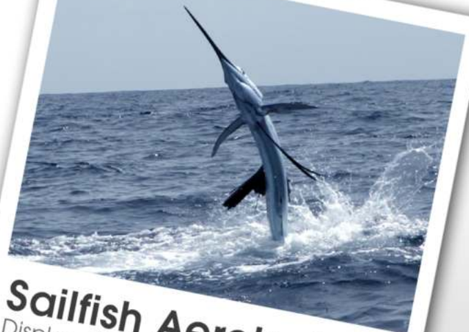
Sailfish Aerobatics, Displays like this are not uncommon

Pacific sailfish inhabit tropical and temperate waters between 24-28 degrees Celsius. In Australia they are more frequently caught between Carnarvon WA northwards to South West Rocks NSW. They are often found close to the coast and around offshore reefs and islands, but are not restricted to these areas. Sailfish will never be far from bait, so focus your efforts around bait grounds and other areas of abundant food supply.