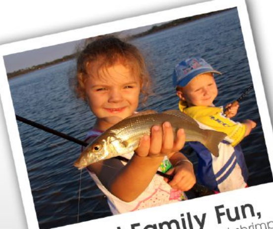
Great Family Fun, This nice whiting took a ghost shrimp

When targeting Sand whiting you have the option of bait fishing in estuaries, bays and beaches vs surface luring in estuaries and bays. When bait fishing use live or fresh bait and incorporate a slow retrieve with the occasional pause into your style. When surface luring constantly cover new ground, cast up current and retrieve with the tide, and vary the action and pace of retrieve. Throwing a pause into a fast erratic retrieve is dynamite on timid fish. To set the hook with whiting employ a slow lift or gentle lean rather than a sharp strike.