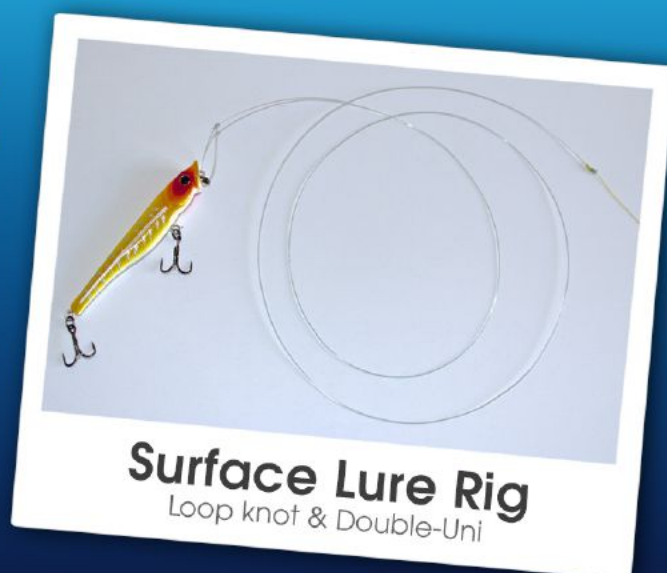
Surface Lure Rig Loop knot & Double-Uni

Targeting Sand whiting on surface lures is great sport and can be quite productive. Use a 2-4lb braid mainline and join it to a 1.5m, 4-6lb mono leader with a Double-Uni knot or similar. At the other end of the leader a loop knot (e.g. Lefty's Loop) will enable walk-the-dog style surface lures freedom to move and zig-zag during the retrieve. Alternatively, tying a knot tight to the tow-point of a cup-faced popper will aid the popper to track straight during a constant blooping retrieve.