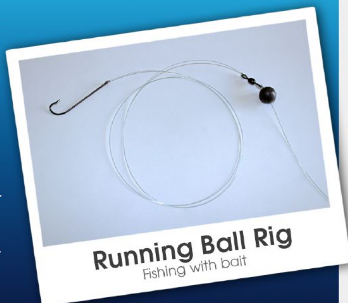
Running Ball Rig Fishing with bait

Whether bait fishing from the shore or from a boat the rig you use remains the same, the only thing that differs is the amount of weight you use. Fishing a monofilament mainline can be beneficial as the elasticity reduces the chance of pulled hooks. Sand whiting rigs vary but a simple rig that works consists of a size 4-8 long shank hook, 0.5-1m monofilament leader, and a running ball sinker above a swivel. Bait up with a live nipper or beach worm and you're in business.