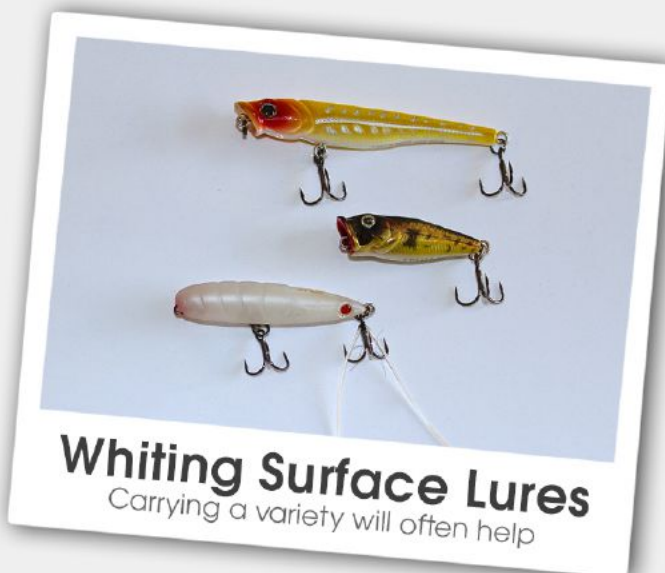
Whiting Surface Lures Carrying a variety will often help

See the 'Fillet Whiting' video for the correct method of filleting Sand whiting.