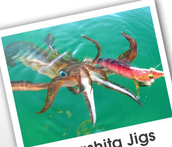
Yamashita Jigs Mindarie, WA

There are two options when it comes to squid, they are cast and retrieve with squid jigs or using a squid spike/prong and bait. When casting jigs let them sink to the bottom and add an upward whip of the rod on the retrieve to make the lure dance in the water. Doing this imparts a prawn or wounded baitfish action alerting any squid in the area. Let the lure sink and repeat. When using bait insert a baitfish onto a squid spike/prong and cast out underneath a float. Wind in and slack line and when the float goes under you on, then gently start winding.